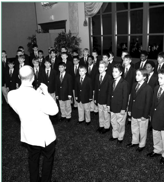
The Florida Singing Sons Boychoir, a beneficiary of the Neil and Janet Maizner Family Fund, performed for Foundation friends at the January 2008 celebration.